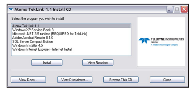
Figure 2: Installation of Atomx Teklink 1.1