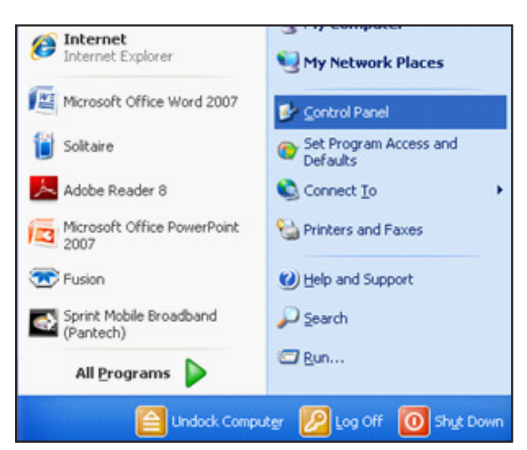
Figure 1A: Control Panel