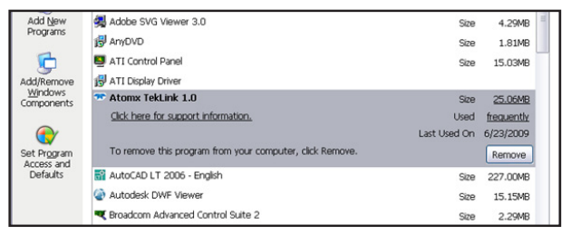
Figure 1C: Removal of Atomx Software