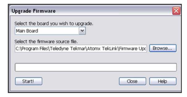
Figure 4: Click Flash to update the firmware and follow the on-screen prompts